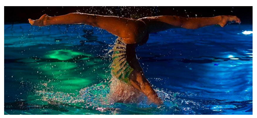
Acrobatic Lift in the team routines